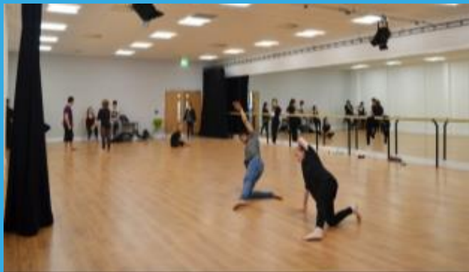
Sprung floored rehearsal studios