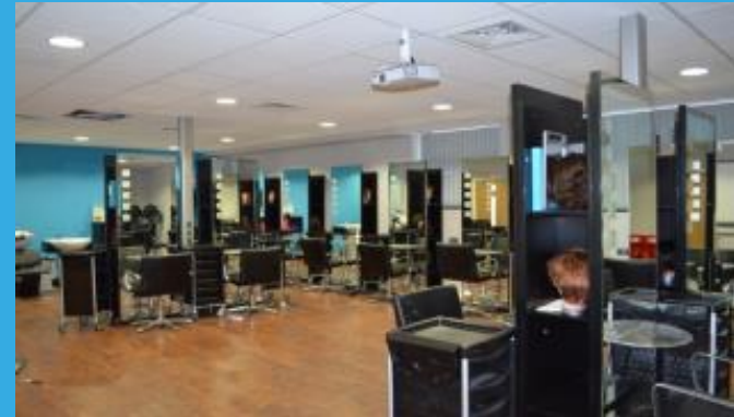
Hair and Beauty Salons