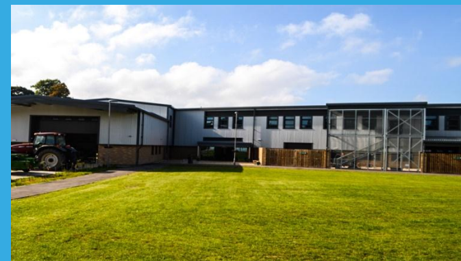
Engineering and Construction workshops