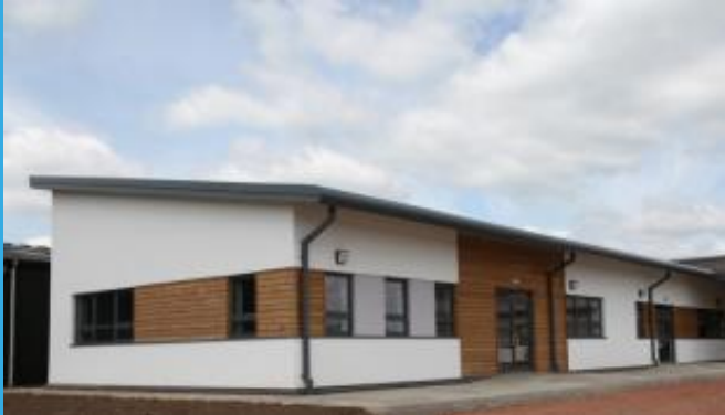
Extension to animal and equine unit