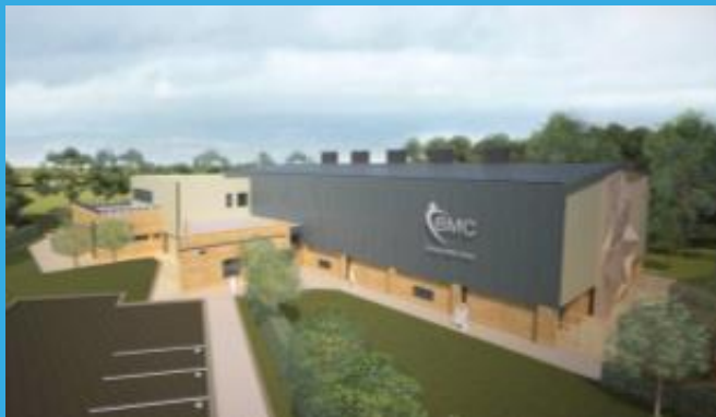
New sport centre and 3G football pitch