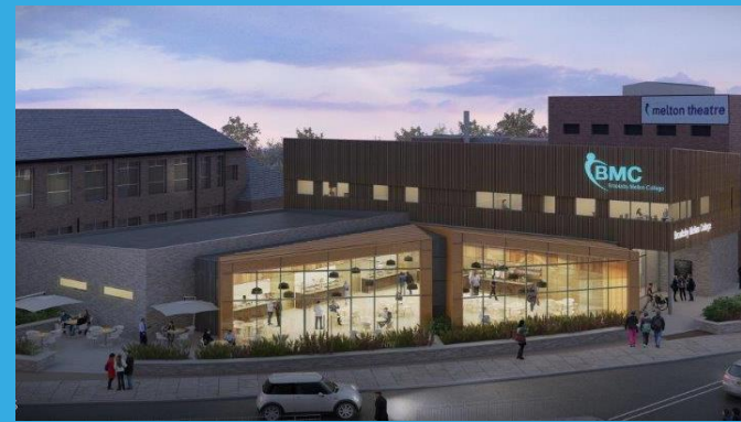
Rural Catering Centre