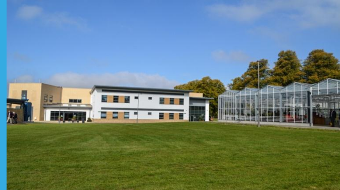
Environmental workshops and glasshouses